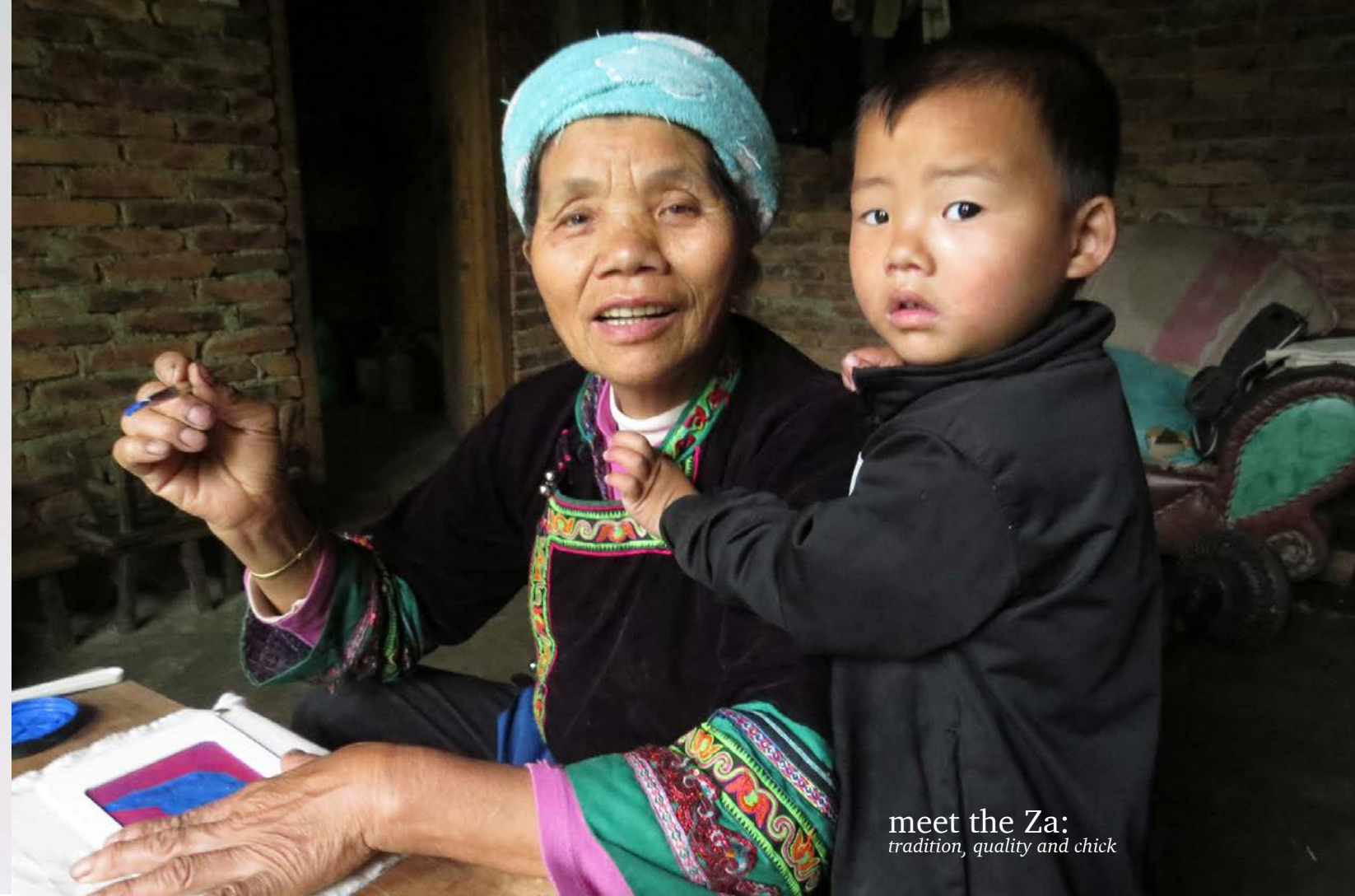
meet the Za: tradition, quality and chick